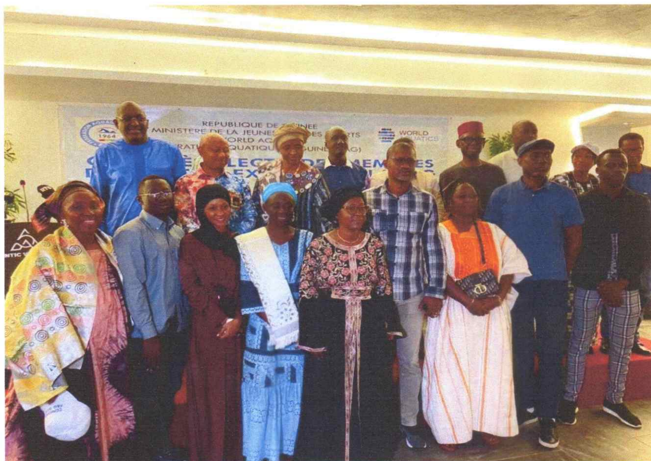
Image of the presentation of the new board elected for the 2025-2029 term